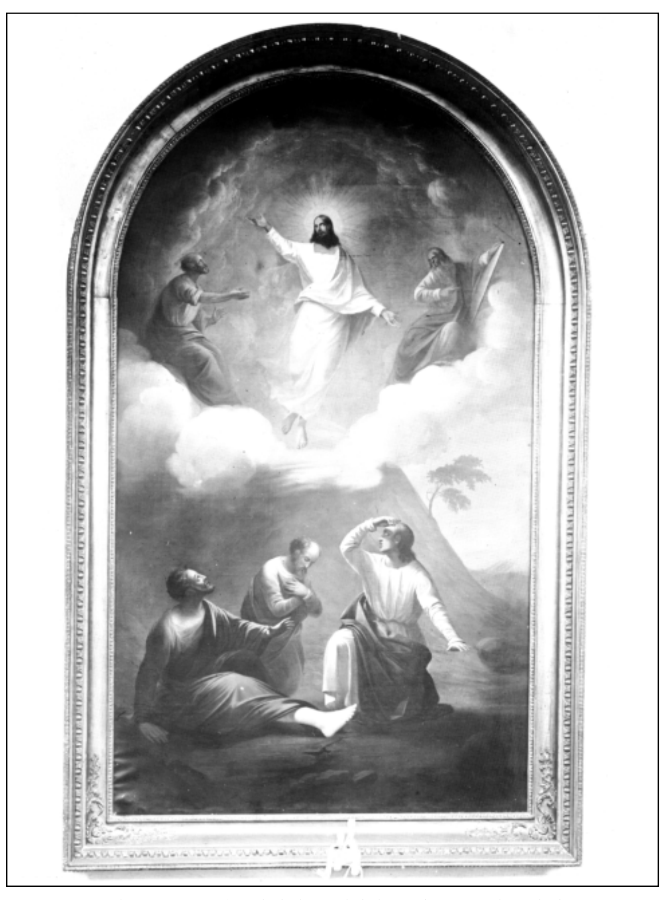
Altarpiece painting of Berndt Abraham Godenhjelm, now being restored in Finland