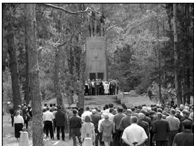
Fig. 4 - The Guta-Mikhalin monument to WWII victims of the Ivatzevichi area

Retreating before the advance of the Red Army in the summer of 1944, the Germans burned down most of the houses in Ivatzevichi. They drove away to Germany for forced labor no less than a hundred Belorussians, Russians, and Poles. In the Ivatzevichi area, they burned down twenty-six villages: Bobrovichi, Borki, Viada, Zatishye, Zybaly, Krasnitsa, Mikhalin, Omelnaya, Tupichitzy, Khodoki, among others. Five of these villages were never rebuilt. 16 After the war, a monument, Guta-Mikhalin, was built over a mass grave, and a cemetery established for peaceful citizens, Soviet warriors, and partisans. 17