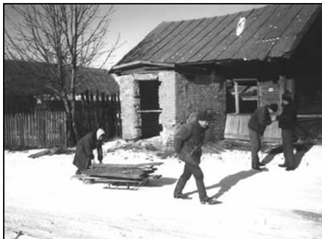
Fig. 8 - Ivatzevichi, winter 2006